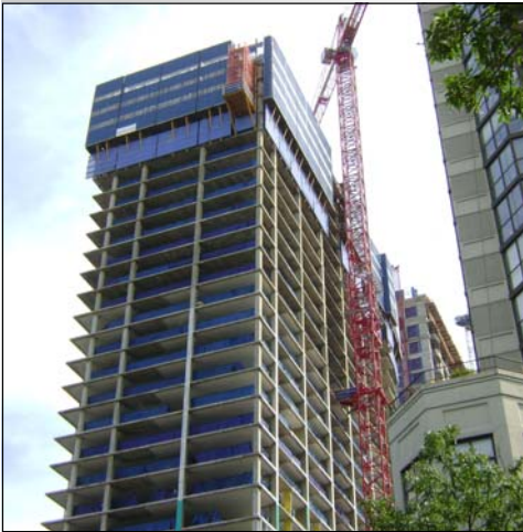
Walton on The Park