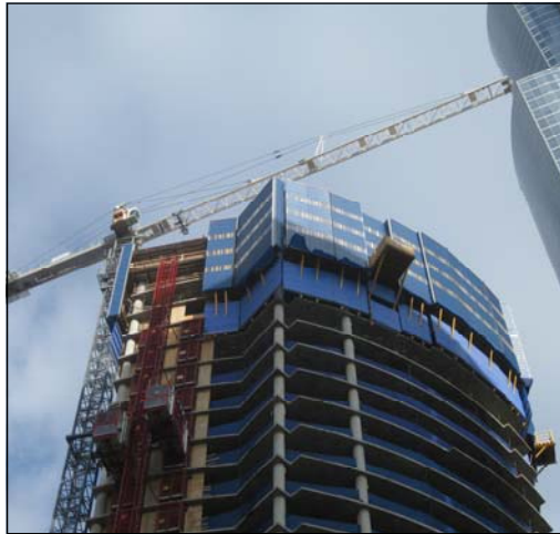
One Museum Park West